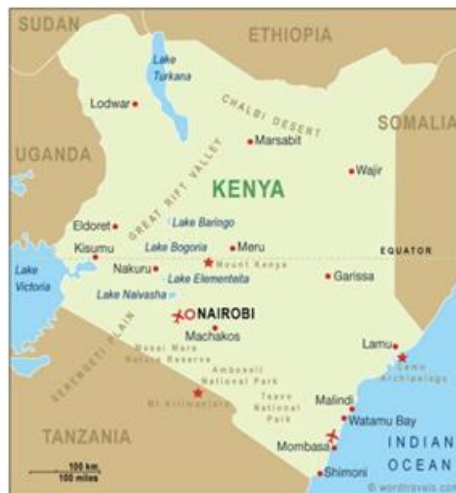
Figure 3 Map of Kenya

The map of Kenya, for reference purpose, is as follows: